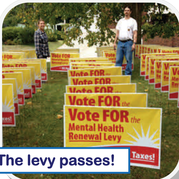
The levy passes!