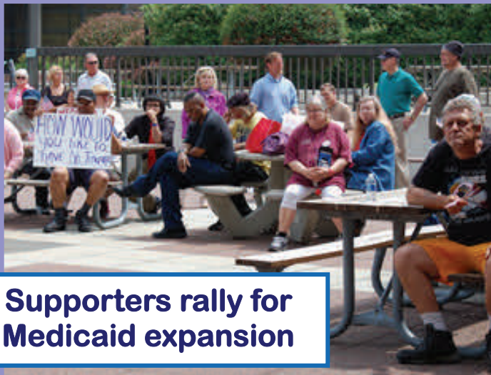
Supporters rally for Medicaid expansion