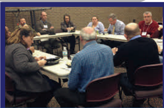
Feedback Informed Treatment training continues