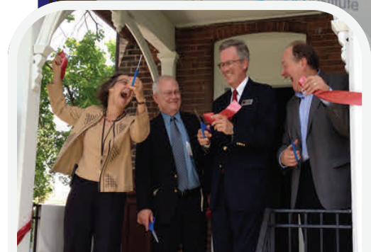
The Clark Greene Madison CRISIS RESPITE CENTER is open!