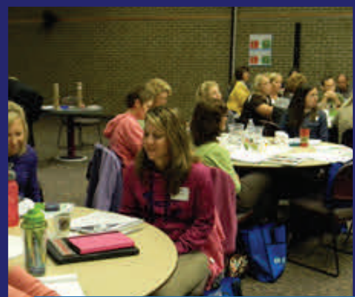
PAX Community Kernels Training